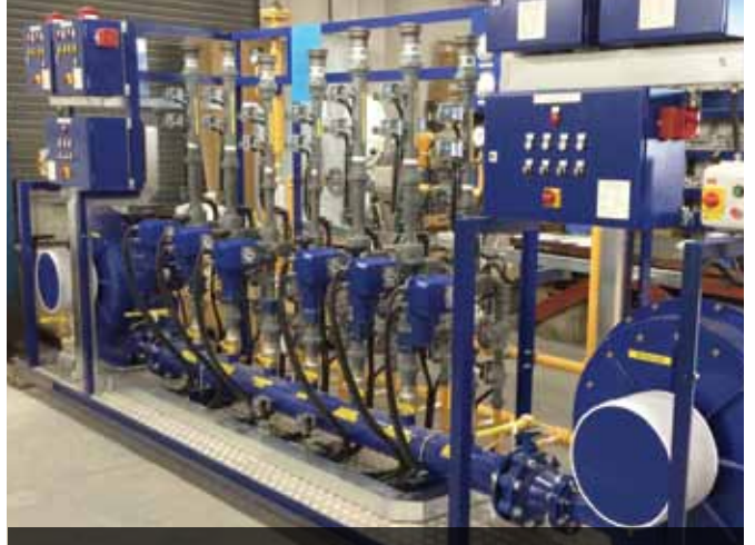
Seven-Zone Combustion Skid Unit During Assembly And Testing At PSR