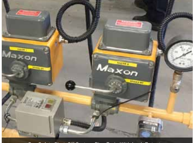
Gas Safety Shut-Off System Pipe Train With Leak Detector.

Each forehearth and its associated Distributor or Alcove Section supplying it has duty and stand-by combustion air fans and gas safety shut-off systems installed as standard. These provide back up in the event of a combustion air fan or gas safety shutoff system component failure or for routine maintenance and testing. The advantage of this configuration is that a component failure on one system would only temporarily affect one production line on an installation with a distributor and several forehearths.