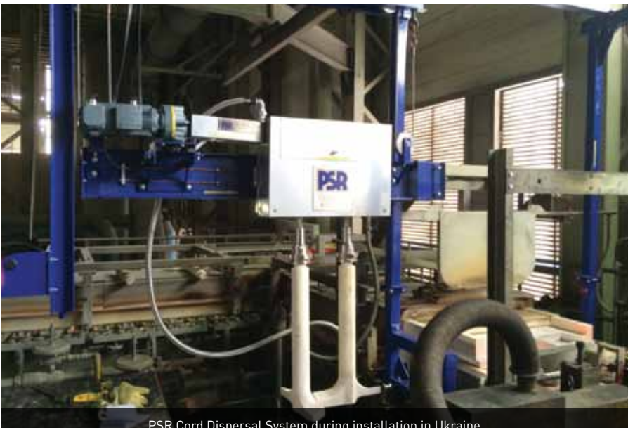
PSR Cord Dispersal System during installation in Ukraine

This repeat business is very typical for our Cord Dispersal System sales. We have many customers who have installed multiple systems, four of whom have 10 systems or more across multiple furnaces and/or factories. This is a clear indication of the results and savings that are regularly achieved by these systems.