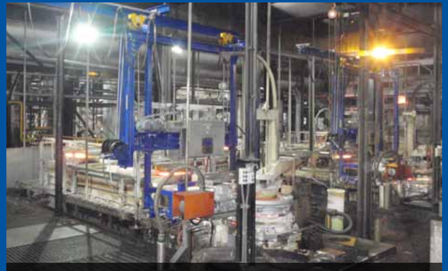
Two PSR Cord Dispersal Systems installed on a tandem forehearth in Mexico

Dispersal Systems on their final seven forehearths. Now, with Cord Dispersal Systems installed on all 13 of their production lines across three furnaces, the factory is our biggest single customer for this equipment.