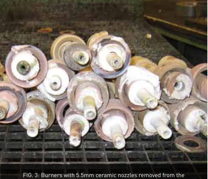
FIG. 3: Burners with 5.5mm ceramic nozzles removed from the frit addition section of a colourant forehearth after six months' operation. The nozzles are relatively free of any condensate build up.

number of interrelated factors including glass composition, glass colour, burner nozzle size and operating temperatures.